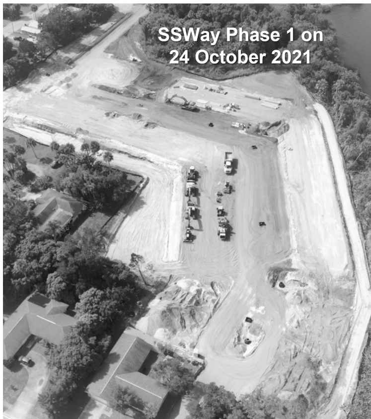
SSWay Phase 1 on 24 October 2021